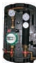
Details of the pump inner with gauges and valves