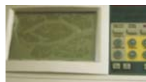
PSP Controller MPI 12 with clear LCD display of time, relays, errors and temperatures

Due to continuous product improvement, product specifications are subject to change without notice ***