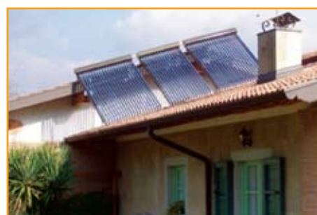
EPL Solar Heating System Installed in Italy, Cagliari (Pitch 42 degree)